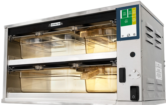
Model RFHU-23-4 4" Deep Multipan Configuration Shown